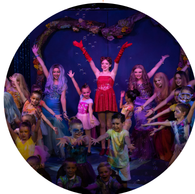
HOUSE BRICK $1,000

By purchasing a show brick you will help contribute funds to the production. In appreciation your name will appear on stage and the program.