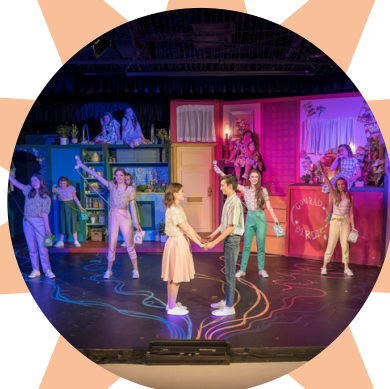
SHOW BRICK $100

We will be holding raffles before each of our performances. These raffles are a great way to promote your business to our North Phoenix community. We will recognize any company that would be interested in donating to our raffle.